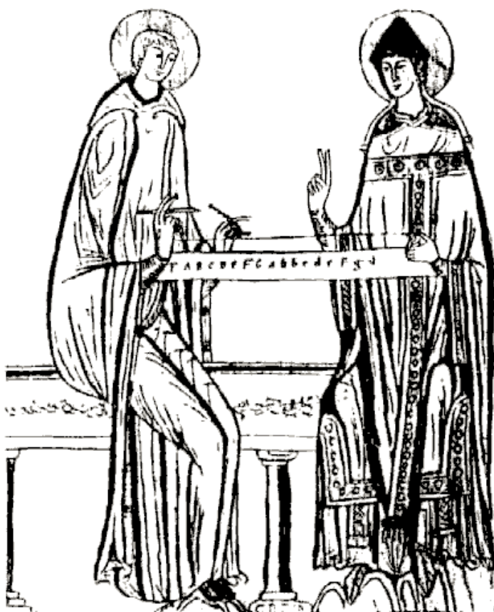
Figure 1. Guido and Bishop Theobaldus

http://www.mtosmt.org/issues/mto.98.4.6/mto.98.4.6.rahn.php